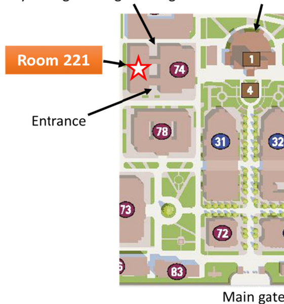
Map of Hongo Campus and location of Room 221